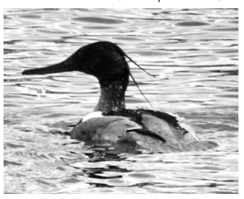
Red-breasted Merganser (Mergus serrator)