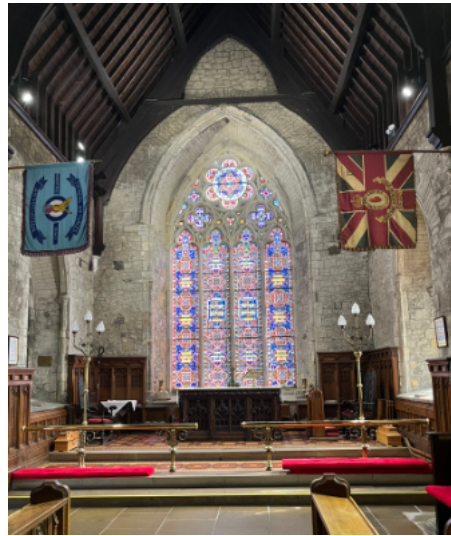
Interior of St Nicolas' Church

The group met at 11am in Joymount Car Park and began a walk along the Carrickfergus Wall Trail at 11.15. We followed the surviving walls of Carrickfergus, especially on the northern circuit, starting at the east end near the shore and finishing at the west end. Mike explained the history of the walls, dating to between 1608 and 1615. At least half of the Carrickfergus Town Walls were visible, often to the full height of 4m to the wall-walk. The wall extended from the castle north-west to Irish Gate , then north to North Gate, east to the rear of the Joymount property and south towards the water. We reached the North Gate (dated 1608) at the end of North Street, twice restored in the 20th century but with some 17th-century stones still visible in the arch. Mike explained that the wall top is narrow and defence could only be by musket. Despite this, when the town was besieged by Schomberg's troops in 1689 it was able to hold out for a week before yielding to a superior force. The town was besieged again in 1760 by a French army under Thurot . As it was Doors Open Day we were fortunate to get a special tour of St Nicholas' Church, dating back to 1182, before adjourning to Castello Italia for lunch.