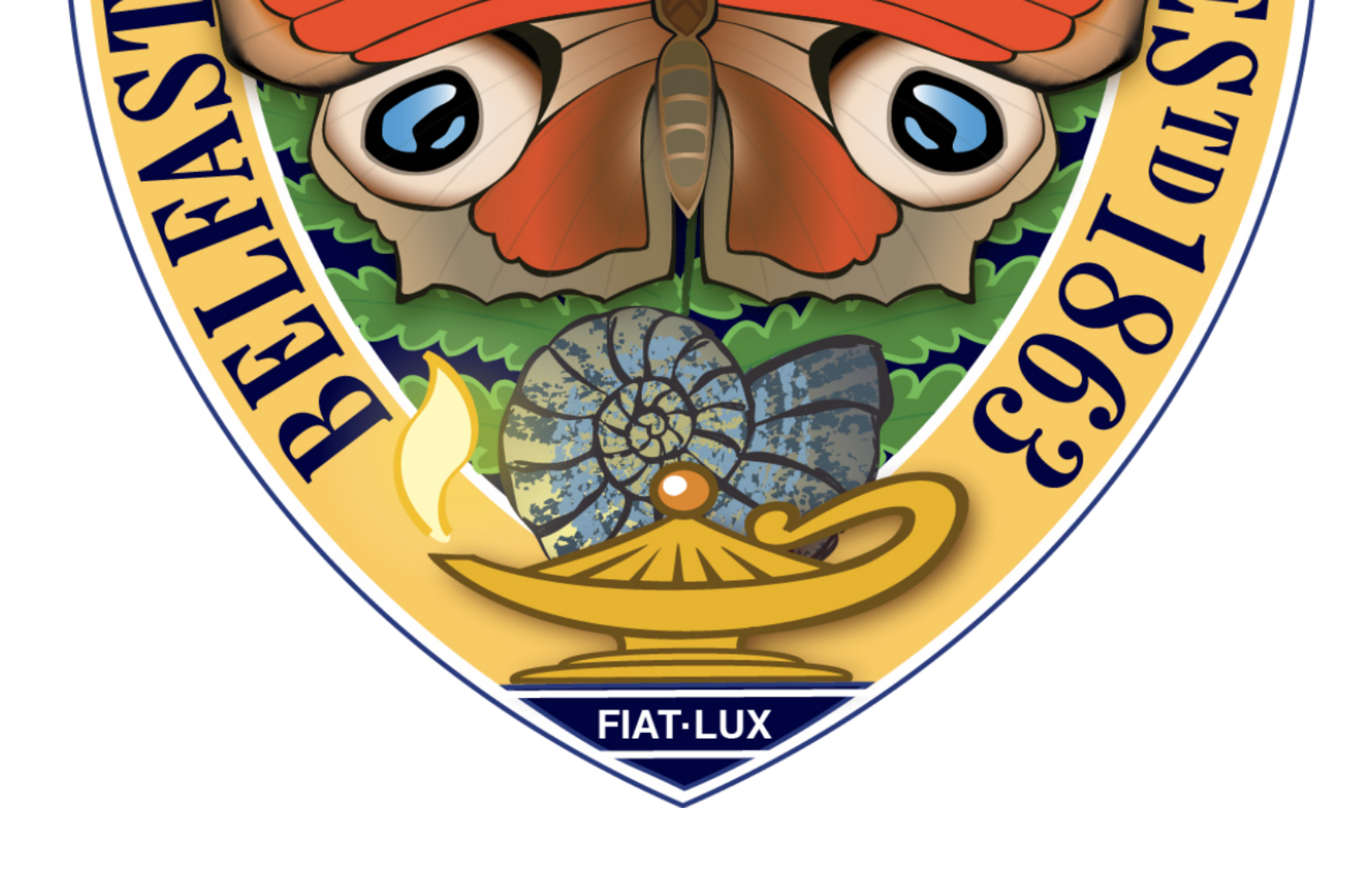
Table of contents 2023