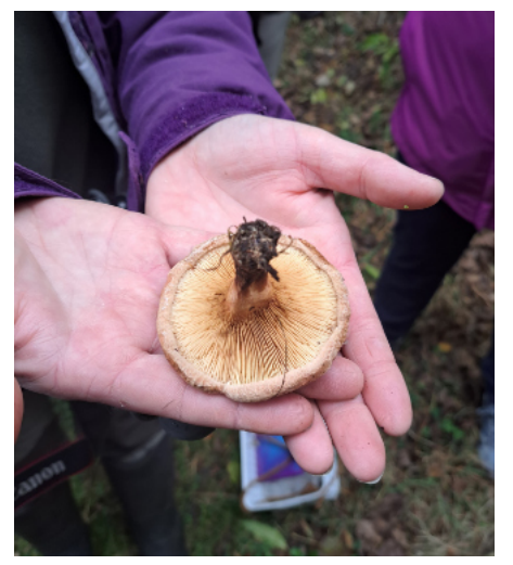
Brown Rollrim (Paxillus involutus)