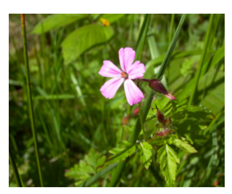
Herb Robert (Geranium robertianum)