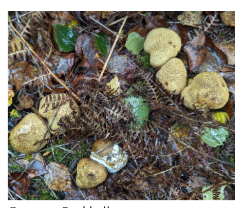
Common Earthballs (Scleroderma citrinum)