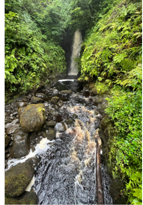
Limestone quarry Cranny Falls