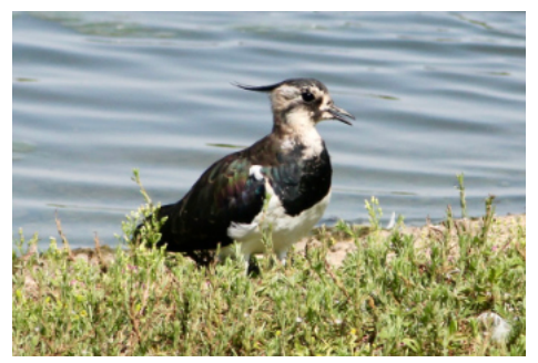
Lapwing (Vanellus vanellus)

Over twenty-five members came on the morning's field trip which took place in beautiful sunny, calm weather.