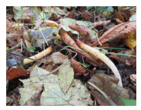
Dog Stinkhorns (Mutinus caninus)