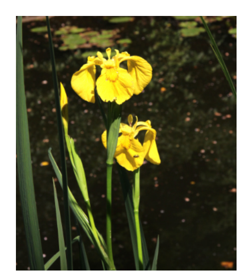
Yellow Iris (Iris pseudoacorus)