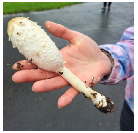
Shaggy Inkcap (Coprinus comatus)

The Northern Ireland Fungus Group (NIFG) had kindly invited members of the BNFC to join them for a joint fungal foray in Peatlands Park, County Armagh. Peatlands Park is a 266 hectares area established in 1990 and managed by the Northern Ireland Environment Agency. It has been designated as an Area of Special Scientific Interest (ASSI) and is home to a particularly rich fauna and flora associated with peat bogs.