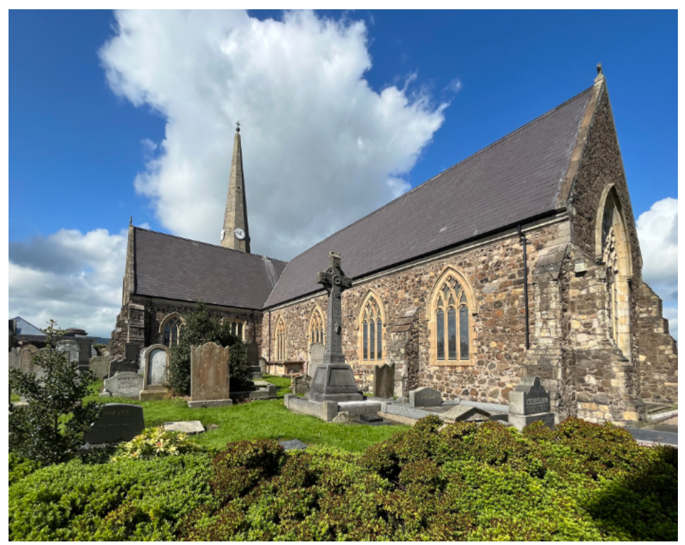
St Nicolas' Church