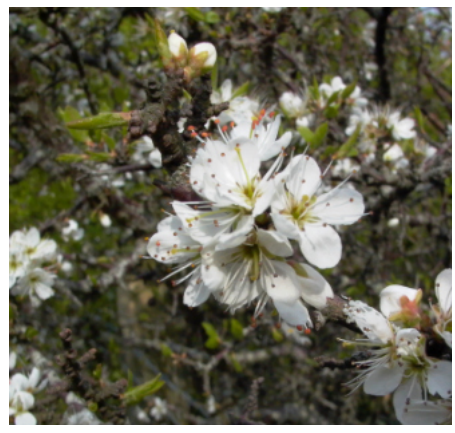
Blackthorn (Prunus spinosa)