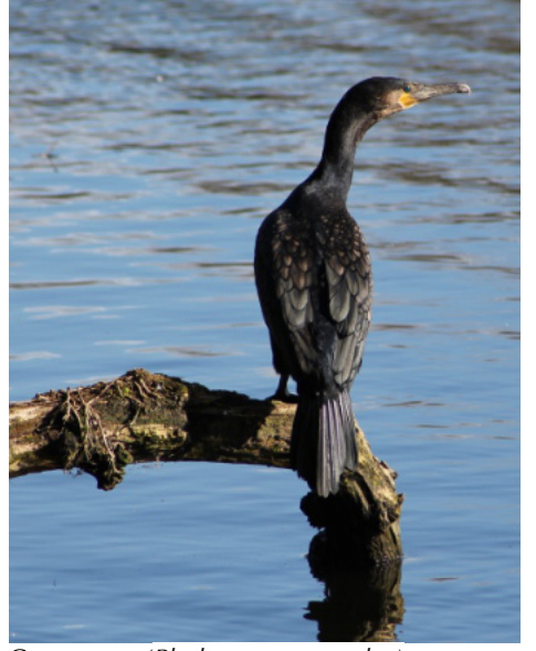
Cormorant (Phalacrocorax carbo)