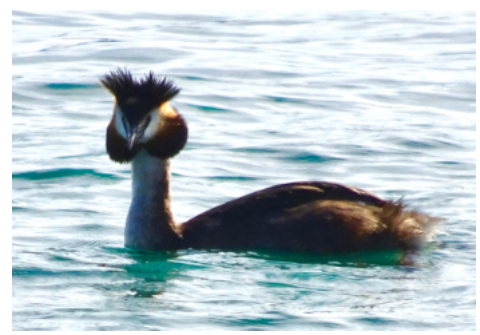
Great Crested Grebe (Podiceps cristatus)