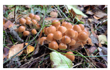
Clustered Brittlestem (Psathyrella multipedata)

Crepidotus mollis Betula Gymnopus confluens Gymnopus dryophilus Inocybe geophylla var. geophylla Betula Laccaria laccata Betula Mycena tenerrima